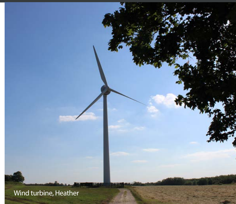
Wind turbine, Heather

Through this plan we will continue to work with partner organisations to help the council achieve its Zero Carbon ambitions and support our businesses and communities to adapt and mitigate climate change.