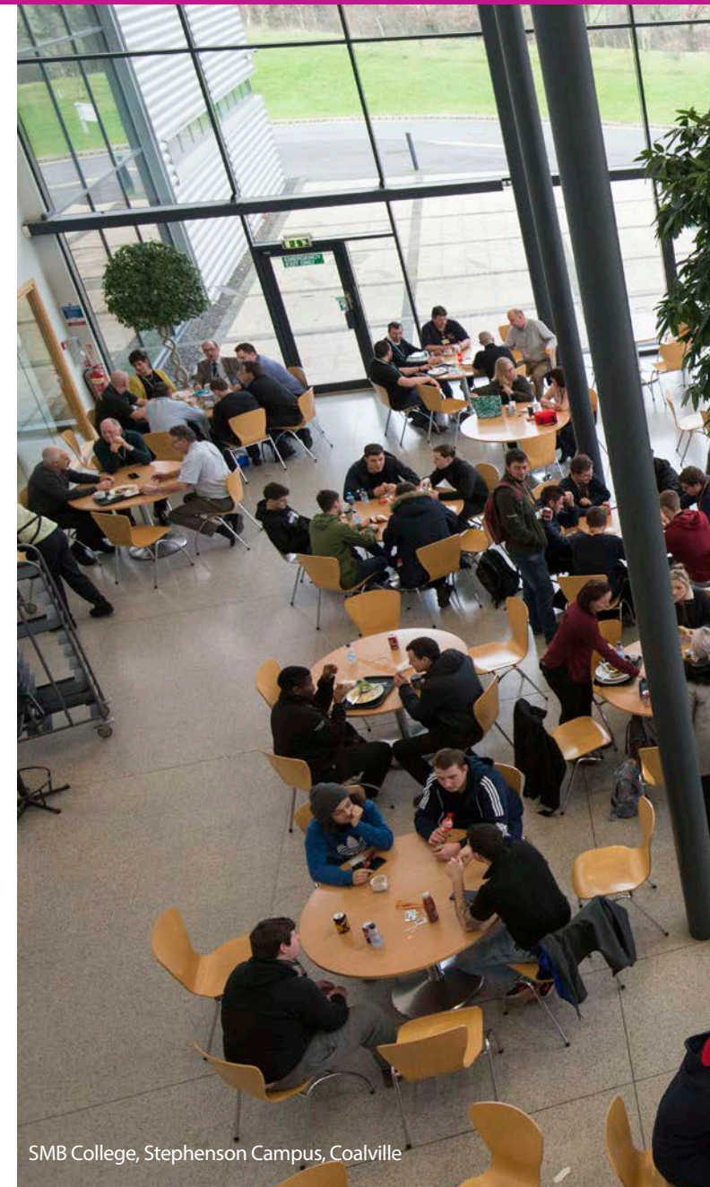
SMB College, Stephenson Campus, Coalville

The pandemic has also provided a stark reminder to every one of the importance of the health and wellbeing both at home and in the workplace. The pandemic resulted in isolation and uncertainty for many alongside economic challenges for businesses and those unable to work.