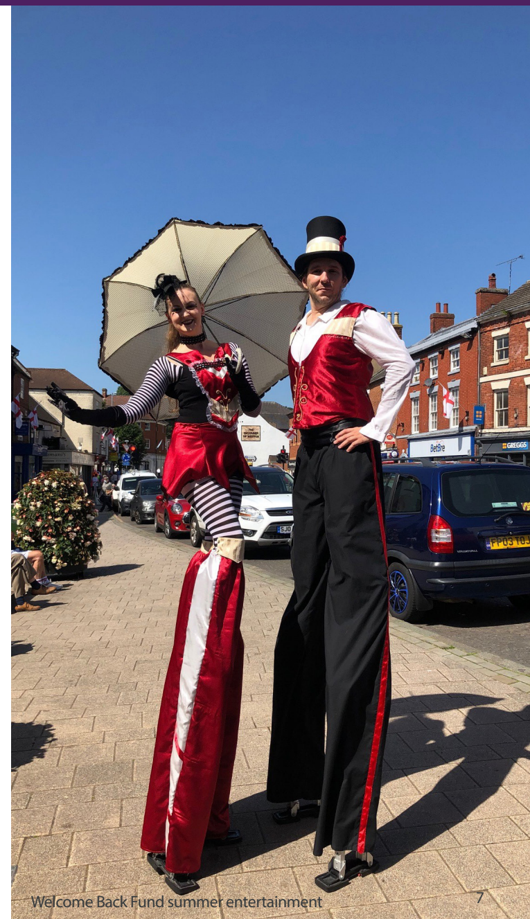
Welcome Back Fund summer entertainment

We also delivered virtual jobs fairs, supported the government's Kickstart programme, provided support to council tenants to access employment and to work from home, made prompt payment to suppliers a priority and delivered shop local campaigns and business start-up support.