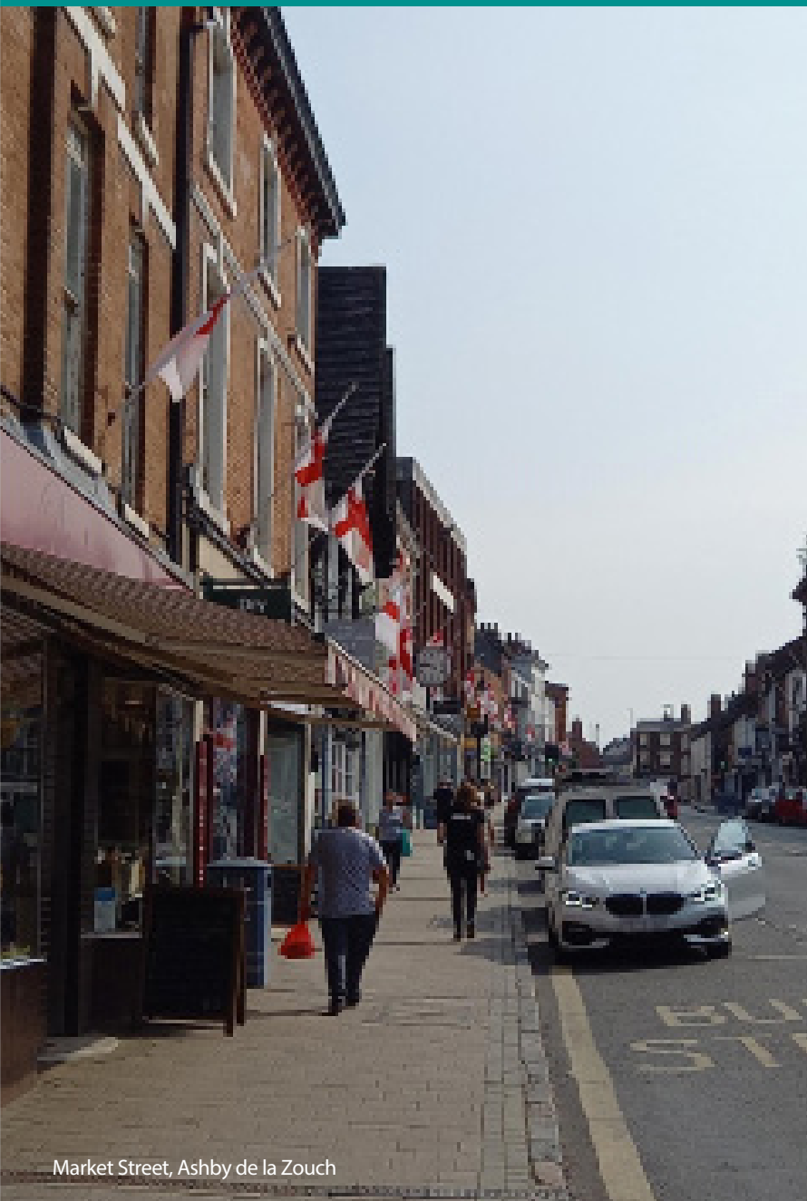
Market Street, Ashby de la Zouch