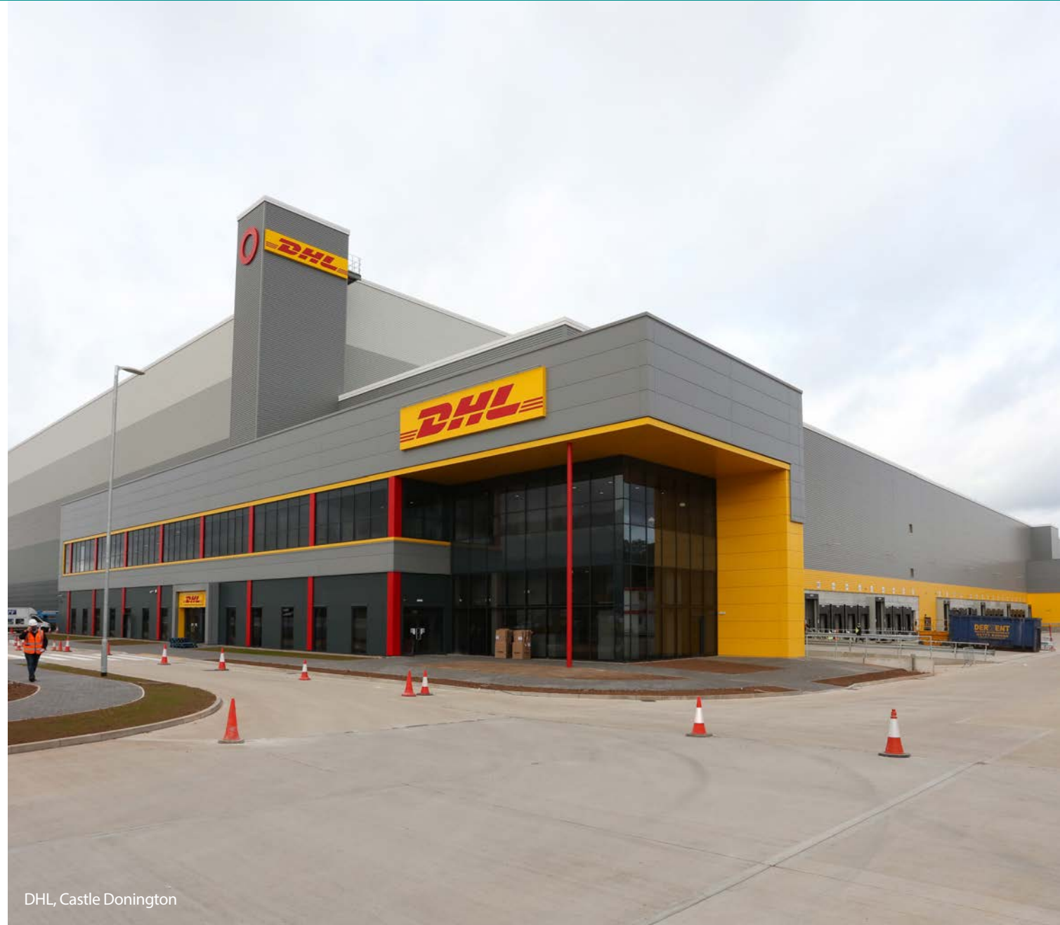
DHL, Castle Donington

Entrepreneurs who are committed to developing businesses will also require advice and support, particularly in the early stages of their ventures when the risk of business failure for start-ups is at its highest.