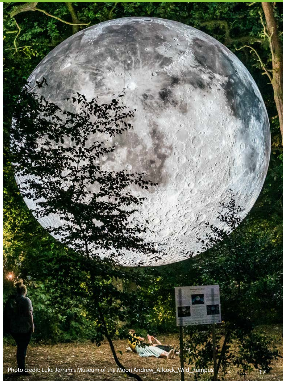
Photo credit: Luke Jerram's Museum of the Moon Andrew Allcock Wild Rumpus

33) Support aspiration for the reinstatement of the Ivanhoe Line led by the Campaign to Re-open The Ivanhoe Line (CRIL) and align to improved walking and cycling networks.