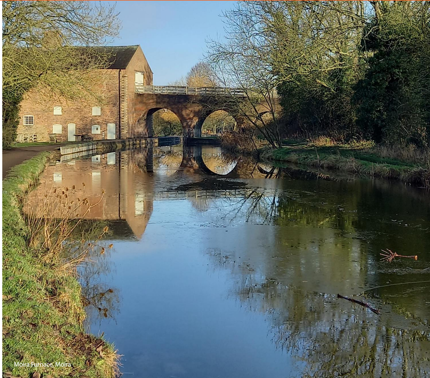
Moira Furnace, Moira

Despite some of these sectors being adversely impacted during the pandemic the sectors have demonstrated growth over a longer time frame and will continue to play a significant role in the continued recovery and growth of the North West Leicestershire economy.